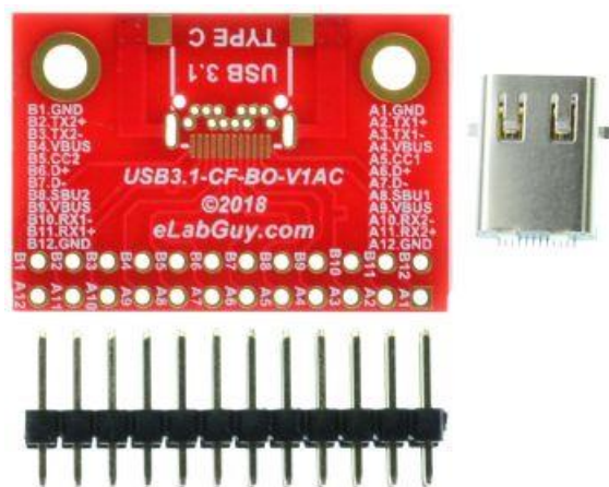
Figure 1: Parts inside the kit (Note: the module is not assembled, user can decide which connector to use on the module.)